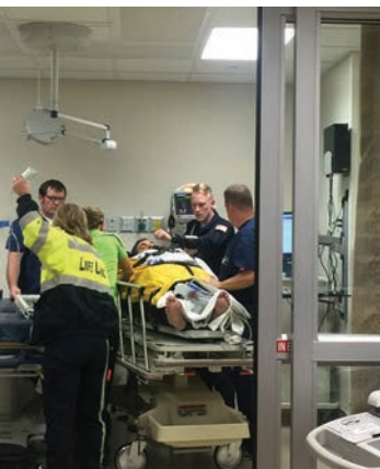
New trauma bay and helipad at RCH&C.

RC Hospital & Clinics is providing Telestroke Services to patients, thanks to a partnership with St. Cloud Hospital Stroke Center. Telestroke allows a stroke neurologist from St. Cloud Hospital Stroke Center to evaluate a patient from our hospital, as well as view diagnostic scans and recommend treatment for greater outcomes.