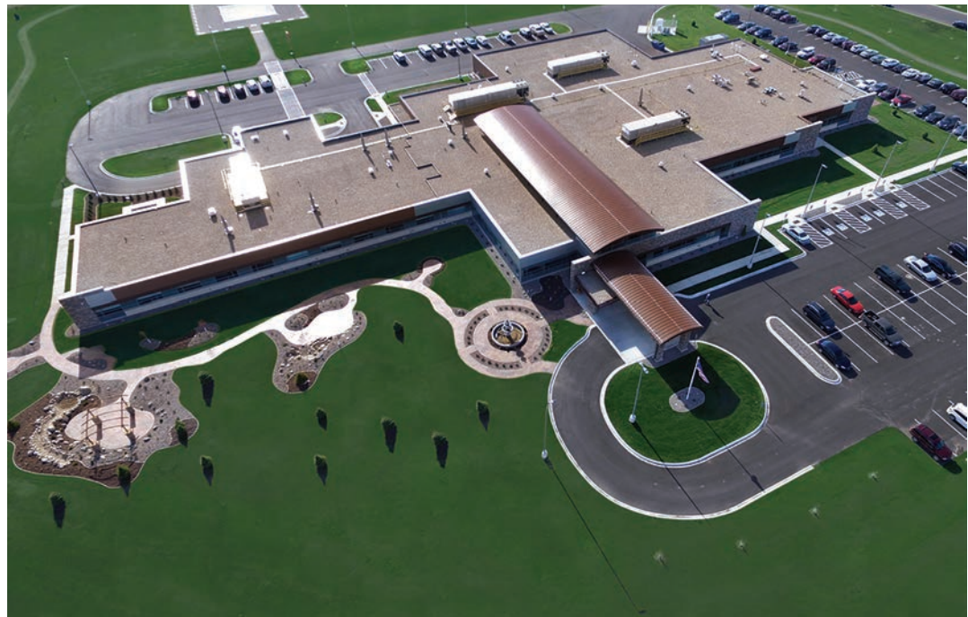
Alma's Garden & Sweet Garden