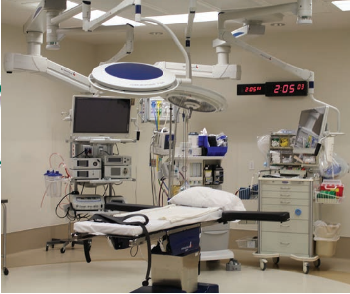
Second Surgical Suite