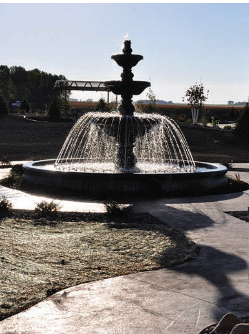
Mehlfouse Family Fountain