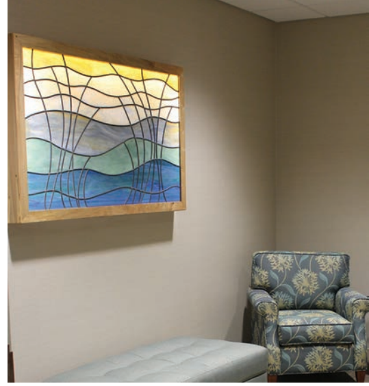
M.E. Rauenhorst Family Chapel