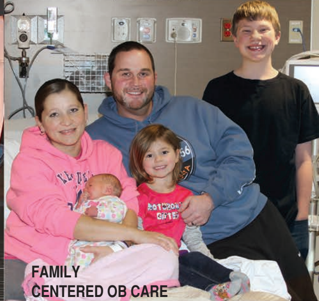
FAMILY CENTERED OB CARE